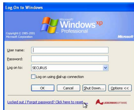
Users Click a Link to Reset Their Passwords

Account Reset Console helps strengthen the security of the IT infrastructure by alerting users and systems administrators about expiring passwords, requiring identity verification prior to changing passwords and forcing users to reset recently changed passwords during the next login.